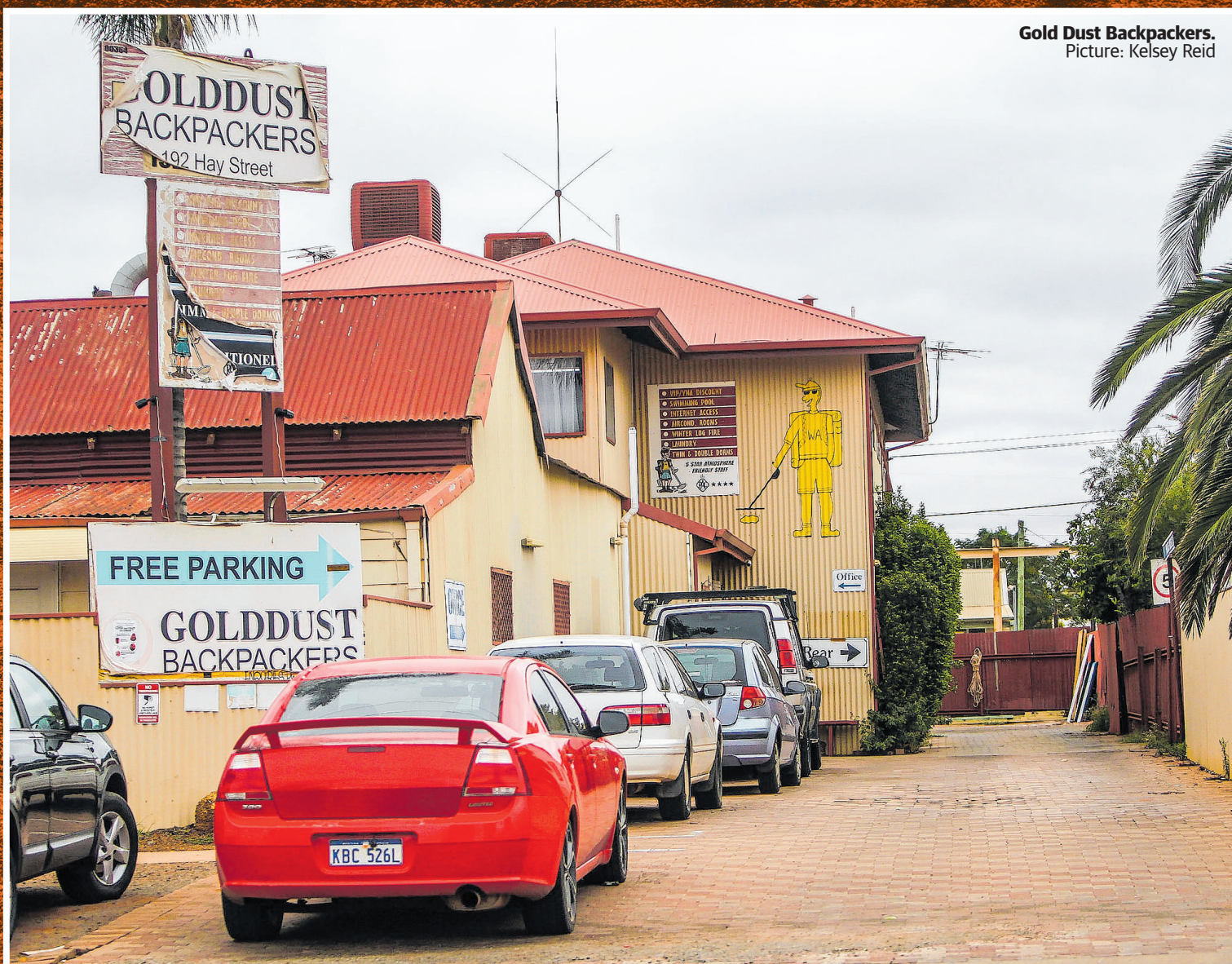
Gold Dust Backpackers.